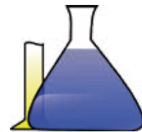
Favorite School Subject