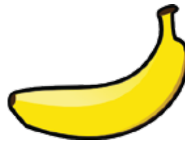
Favorite Fruits of a group of people